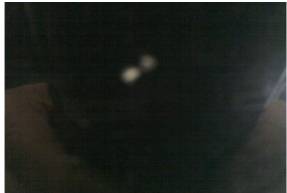
stone chips on bonnet