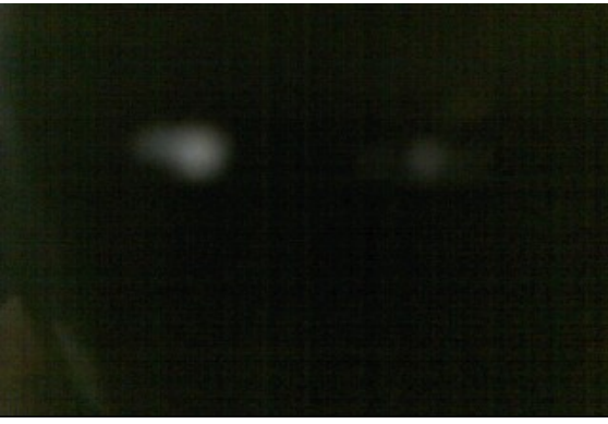
nsf door chips