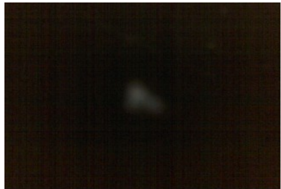
nsr door chips