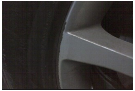
nsr alloy scratched